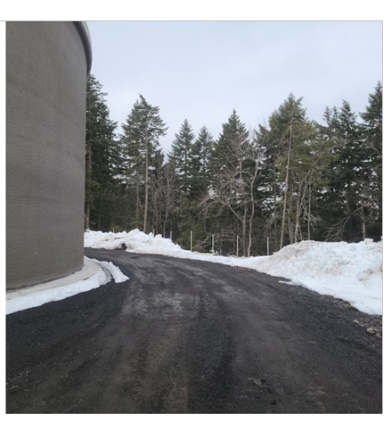
This Project is 95% complete and will be completed by June 2022. The reservoir is on, and now feeding the Mid-Valley of our District.